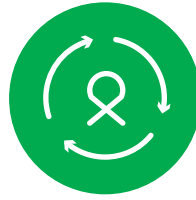
Build a Resilient Workforce