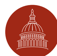
Public & Institutional Policy