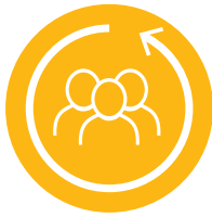
Understand the Human Capital Ecosystem

Our customized products and services drive alignment between workforce and economic development.