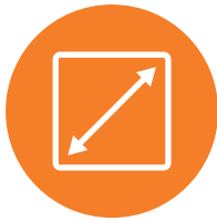
Achieve Scale to Drive Economic Growth